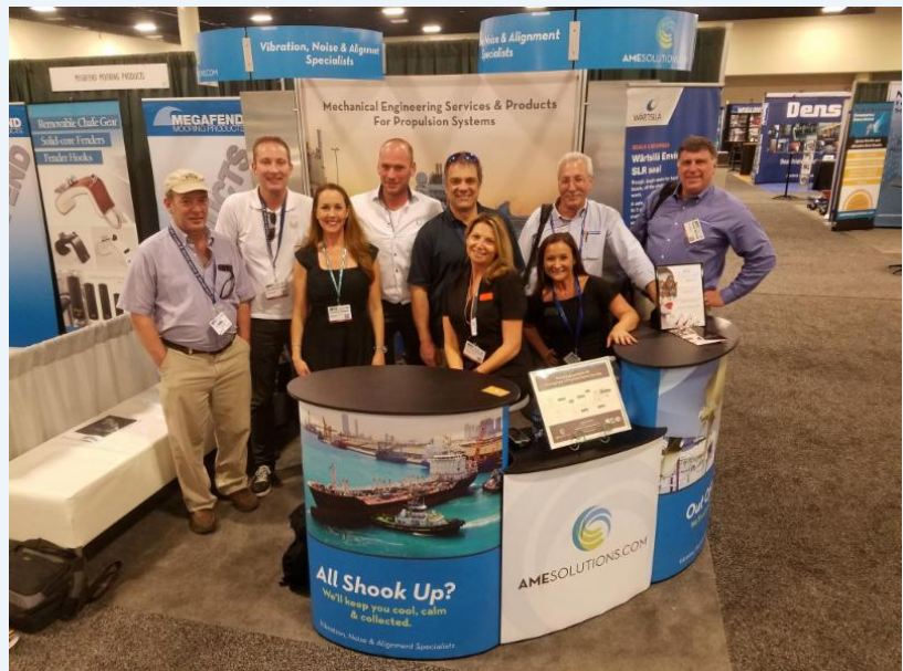
AME & Wartsila with industry friends from Soundown, representatives for Rubber Design.

AME exhibited for the second year in a row at the Refit International Exhibit & Conference , put on by Professional BoatBuilder. Not only did we have our own booth, but we were also invited to display in Lauderdale Marine Center/LMC's booth as a Tenant Partner!