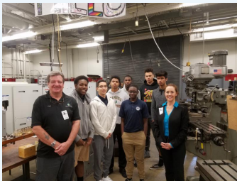
Atlantic Technical College and Technical High School